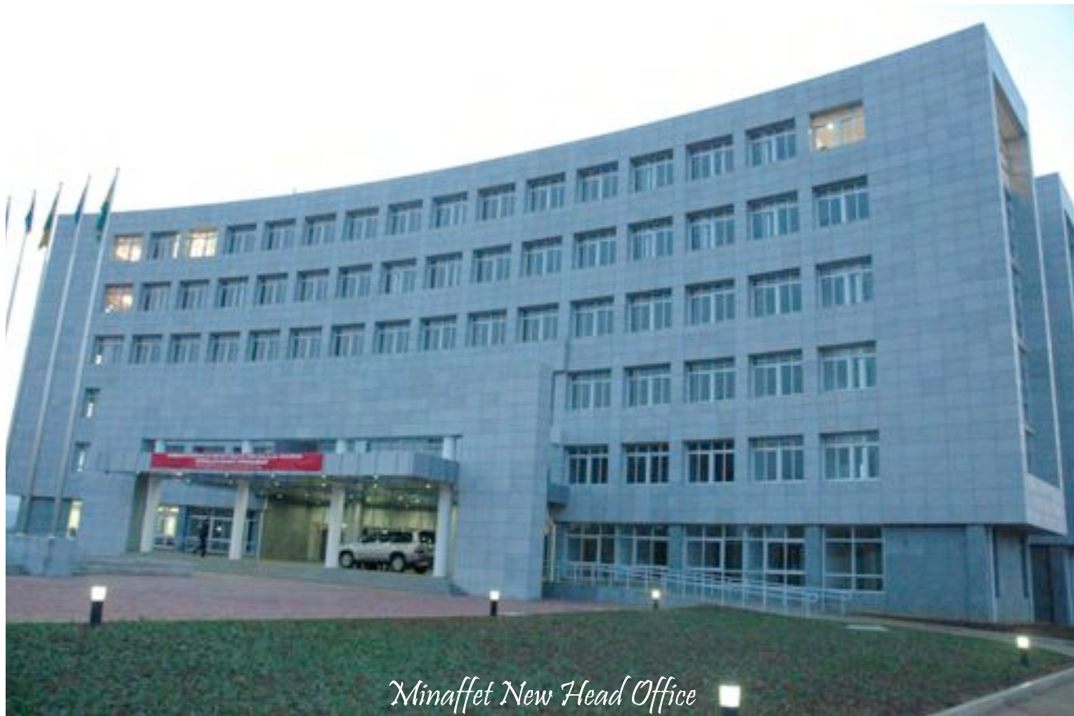
Minaffet New Head Office