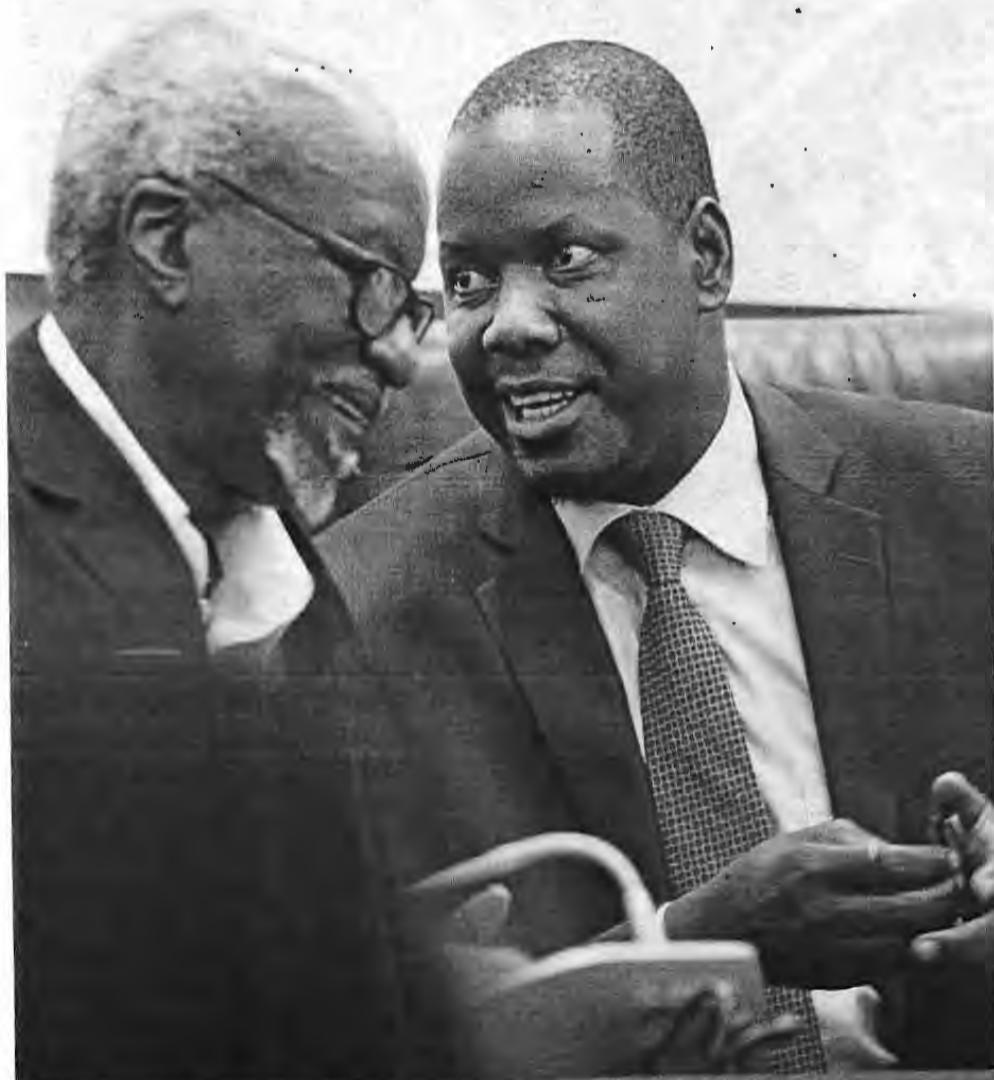
Kirunda Kivejinja, the Ugandan third deputy prime minister and minister for EAC Affairs (L), chats with Kidega during the news briefing in Kigali yesterday. Timothy Kisambira.