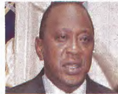
Discussed. President Uhuru Kenyatta

"Nigeria and South Africa have been working this for some time," said the source who is knowledgeable about the Trump administration's efforts to formulate Africa policy. "They've been in contact."