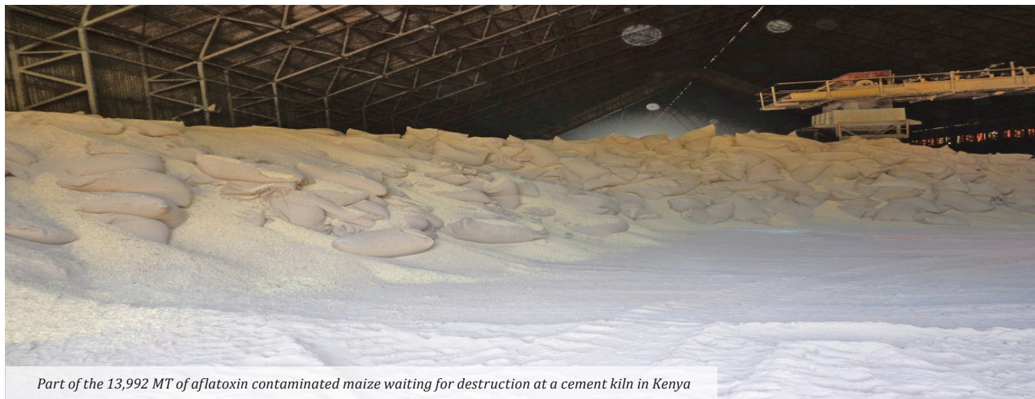
Part of the 13,992 MT of aflatoxin contaminated maize waiting for destruction at a cement kiln in Kenya

The heightened sampling and testing of aflatoxin susceptible commodities followed by regulatory recalls and withdrawals of aflatoxin contaminated commodities has led to confinement of contaminated stocks in institutions of learning, food manufacturing premises, business operator premises, cereal depots, amongst other government and non-government institutions pending an amicably agreed decision on alternative uses and/or mode of disposal.