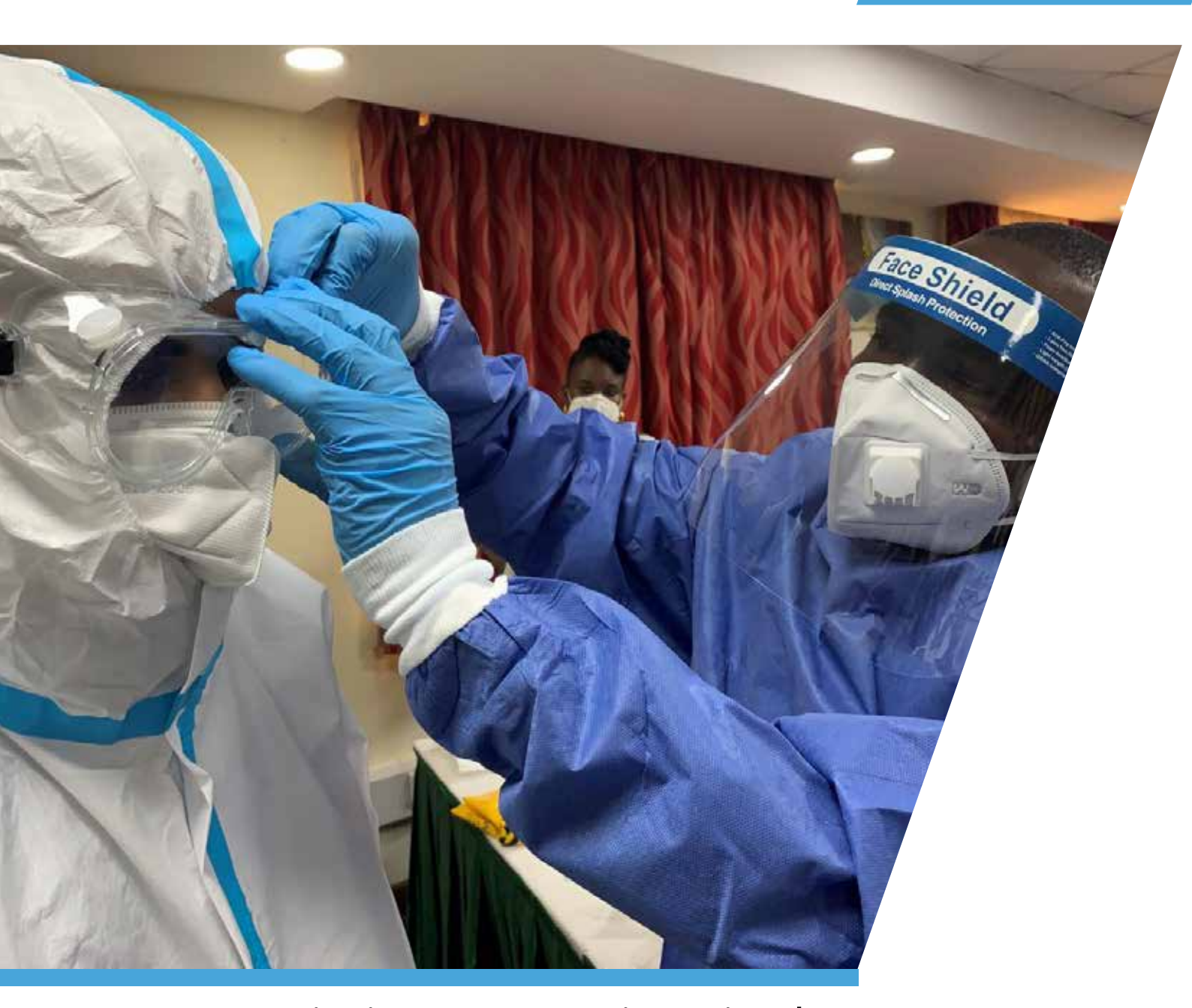
Priority Interventions in the 6<sup>th</sup> Development Strategy