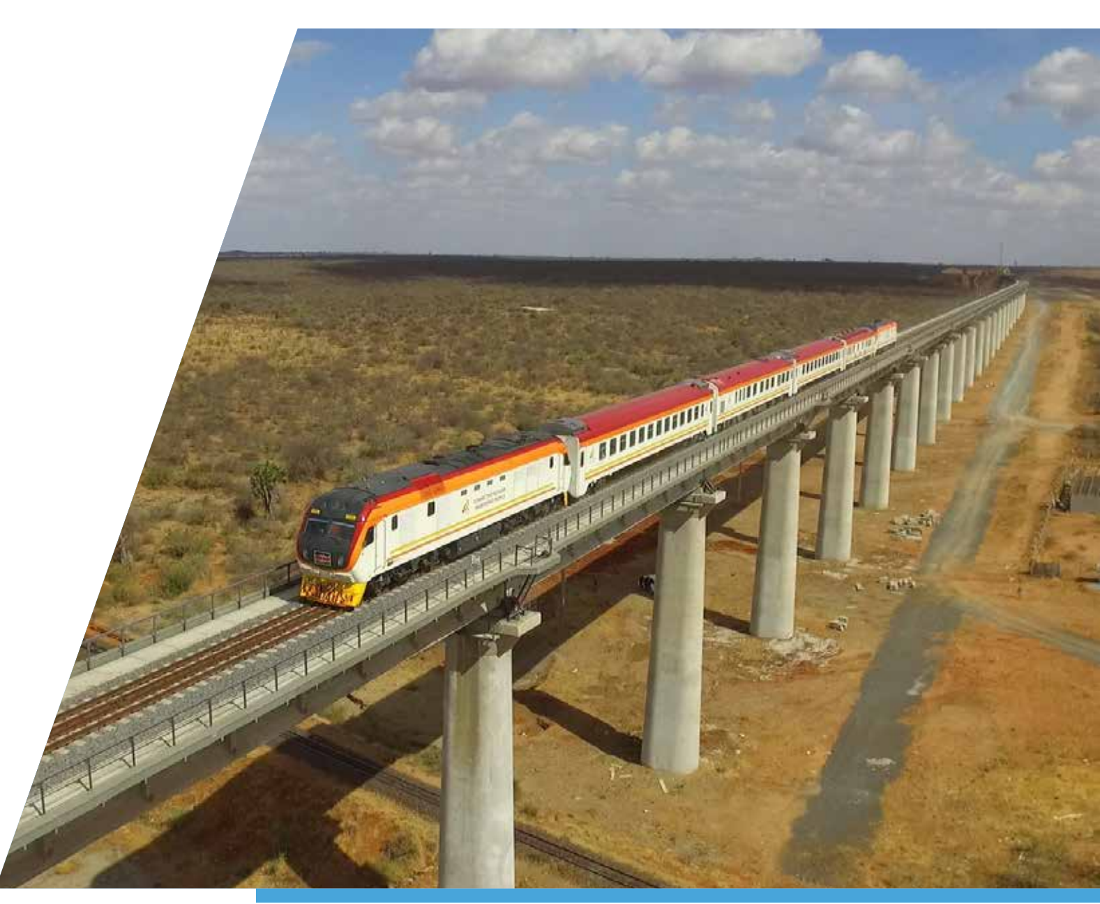
Broad Development Context for the 6<sup>th</sup> EAC Development Strategy